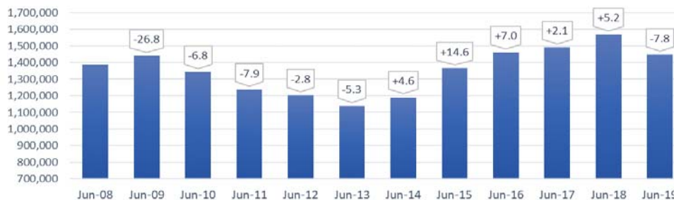
New passenger car registrations in the EU - month trend | 2008-2019

Next press release: Wednesday 18 September 2019